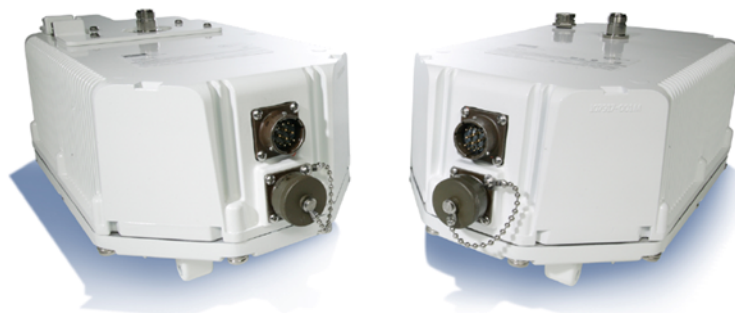
Figure 1. Cisco Aironet 1500 Series

The Cisco Aironet 1500 Series supports options for dual-band, simultaneous support for IEEE 802.11a and 802.11b/g standards with the 1510 model or single-band support for IEEE 802.11b/g with the 1505 model. Both models employ Cisco's patent-pending Adaptive Wireless Path Protocol (AWPP) to form a dynamic wireless mesh network between remote access points, while delivering secure, high-capacity wireless access to any Wi-Fi-compliant client device (Figure 2).