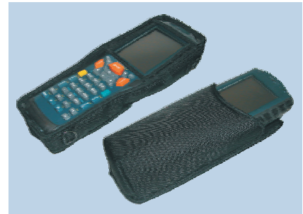
Functional Case and Belt Holster