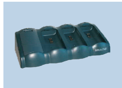
Multiple Battery Charger