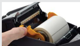
Intuitive peeler operation